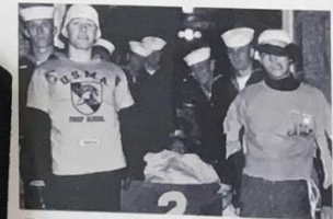
The men of Company B, dressed in procured MAPS gear, depart to meet the foe at the football game.