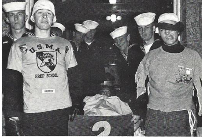
The men of Company II, dressed in procured MAPS gear, depart to meet the foe at the football game.